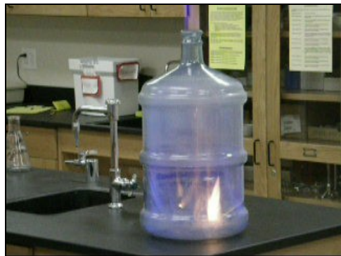
Figure 1. Ethanol vapors igniting